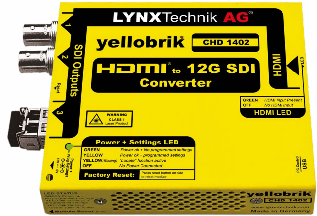
Shown with optional fiber SFP installed

Note: For legal reasons, HDMI capture devices from LYNX Technik AG are designed not to capture, convert or transmit video or audio from HDCP copy-protected sources (e.g. Satellite receivers, Cable receivers, etc.).